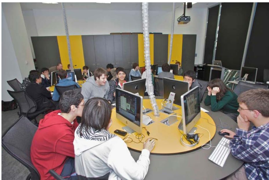
Figure 4. Production Studio at ACMI

ACMI also stands by the strength of the workshop methodology and, reflecting on our history of delivering this program, it is this ‘workshop’ production process that is the crucial component to the program’s success. The public courses at ACMI include a three day public workshop and a four day ‘train the trainer’ program and for educators a specific digital storytelling program known as ‘My Story’. The train the trainer and the educators’ program has equipped many individual practitioners and representatives from many key Australasian cultural and educational organisations to develop a program or practice within the context of their own organisations or community. Alongside these public offers ACMI also works in partnerships with very diverse communities to develop specific digital storytelling projects. This aspect of the program is significant and over the years has produced the majority of the content exhibited and collected.