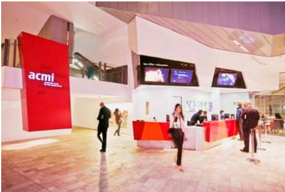
Figure 2. Photo of ACMI box office.

environment. Finally, the role an organisation such as ACMI might have in the future of Digital Storytelling as a practice is discussed.