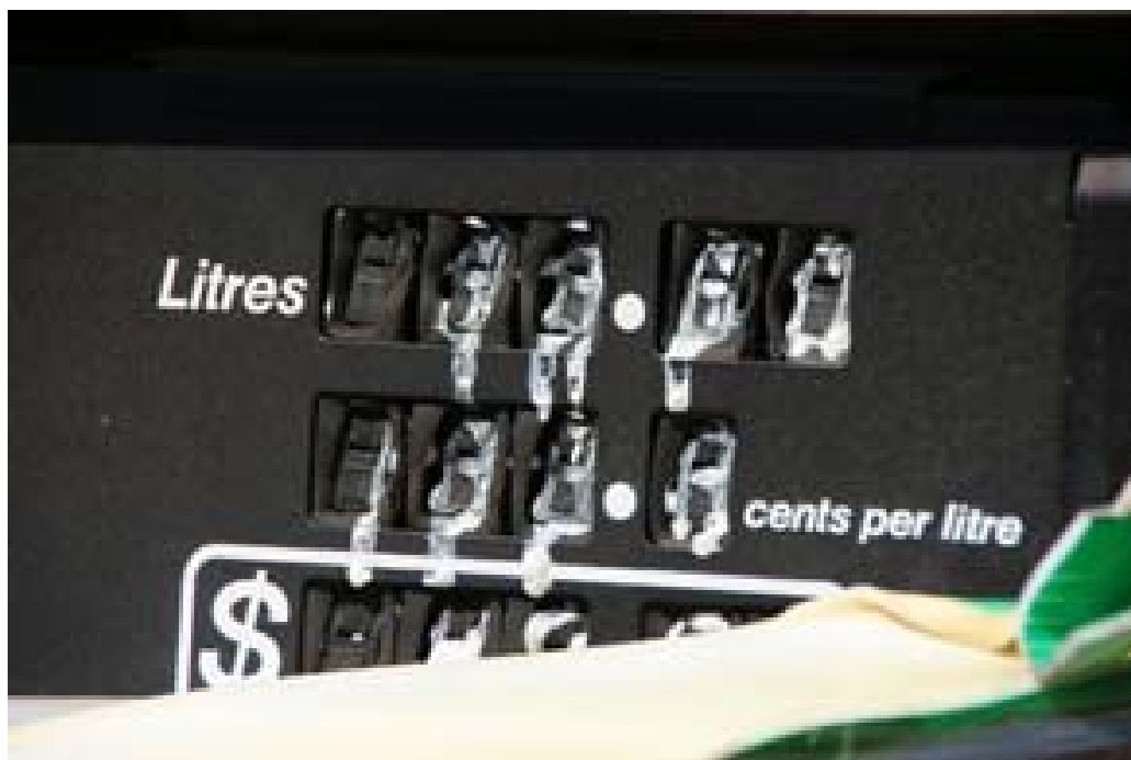
Figure 8. Image from Black Saturday fires February, 2009 Murrundindi Victoria which is part of the Living with Disasters Digital Storytelling Project in partnership with Attorney General's Department and the CFA.

Due to the increased accessibility of technology, many organisations now have the capacity to develop their own digital storytelling projects and to distribute these online, without the help of a media based organisation like ACMI. Furthermore, over the years ACMI has trained many community organisations in the digital storytelling methodology, enabling them to sustain this approach to content creation. The in-built training pedagogy of the program supports sustainable practice and also means that the direction of the ACMI digital storytelling program will shift with time.