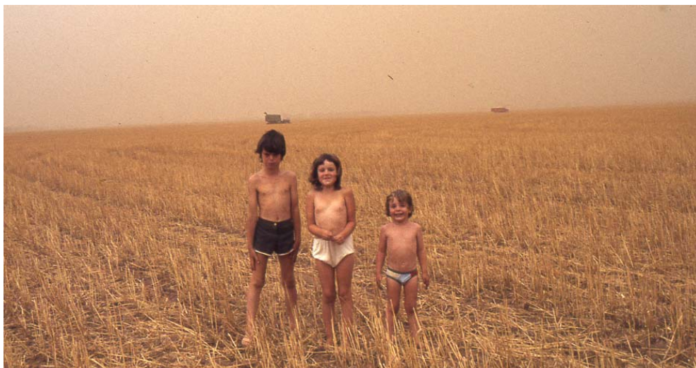
Figure 5. Image from the story Mallee Bloom by Maureen Barry which is part of the Against the Grain Digital Storytelling Project.