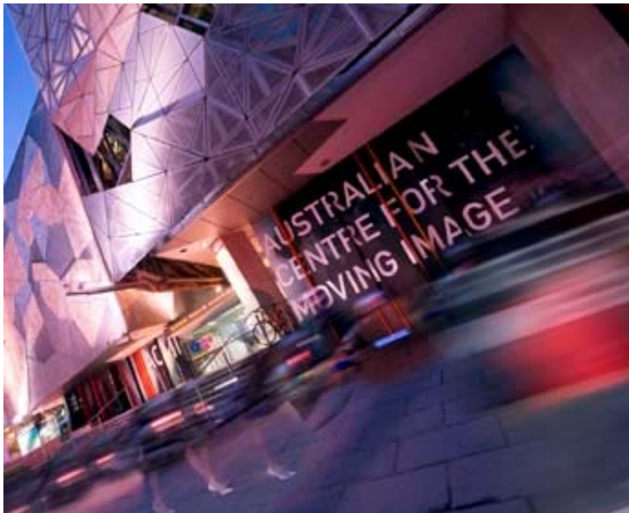
Figure 1. Image of Flinders St Entrance ACMI. Photographer David Simmonds.

This paper charts the development of the Digital Storytelling program at ACMI. In doing so, it captures some of the understandings gleaned as a result of being one of the first cultural institutions to develop a major user-generated content program, and identifies the challenges for the organisation in ensuring this program stays relevant in a rapidly changing media landscape.