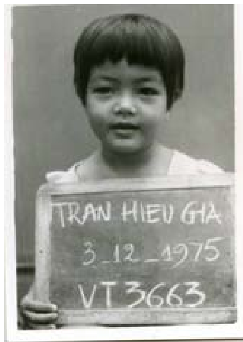
Figure 7. Image from the story Changing Worlds by Mui Mui Tran which is part of the Recovering Hope Digital Storytelling Project.

The digital storytelling program supports the notion of participatory culture in a way that allows communities to find a 'voice'. Such a program also enriches the lives of participants by enabling them to draw upon and develop their own creativity in the process of exercising this voice. As the user-generated content movement continues to develop new modes and aesthetics in storytelling, I still think it is the capacity to search for meaning and justice through people telling their own stories that is important. While there are far more sophisticated and interactive story formats, the need for communication, narrative and storytelling remains as strong and essential as ever and these simple linear works achieve this so powerfully.